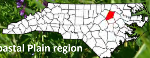
Coastal Plain region

Cover crop biomass production on April 24, 2016 averaged 974 lb/A when broadcasted, 1086 lb/A when drilled on Dec 8, and 496 lb/A when drilled on Jan 8