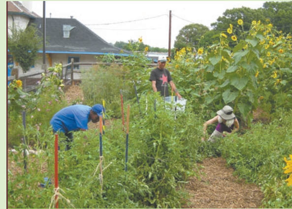
URBAN GARDENERS, CHARLOTTE.

There are many types of organizations that choose to sponsor and support community gardens. The following places may have land, resources, and interested employees or clients.