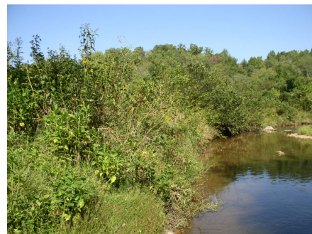
Photos of Conservation Easements taken during 2008 Reviews